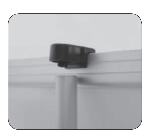
Lift the top rail to raise the graphic from the base.

Hold the top rail whilst lowering the banner, (do not drop) to prevent damage to the graphic