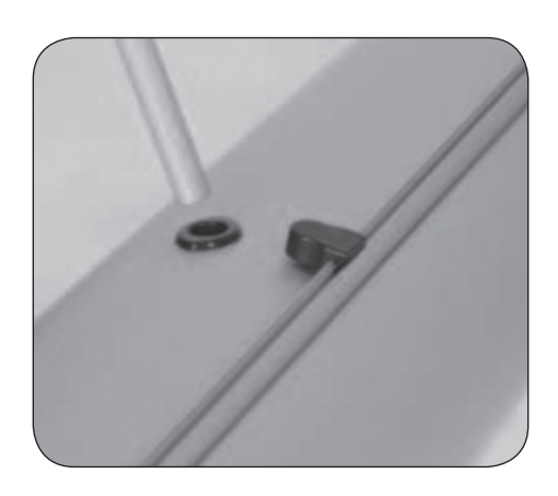
Slot the pole into the hole on the base and push down to secure fit.