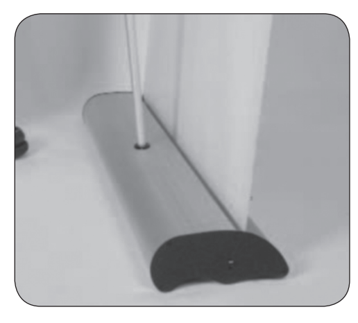
Pull graphic out of unit and tilt back to reach the top of the pole.